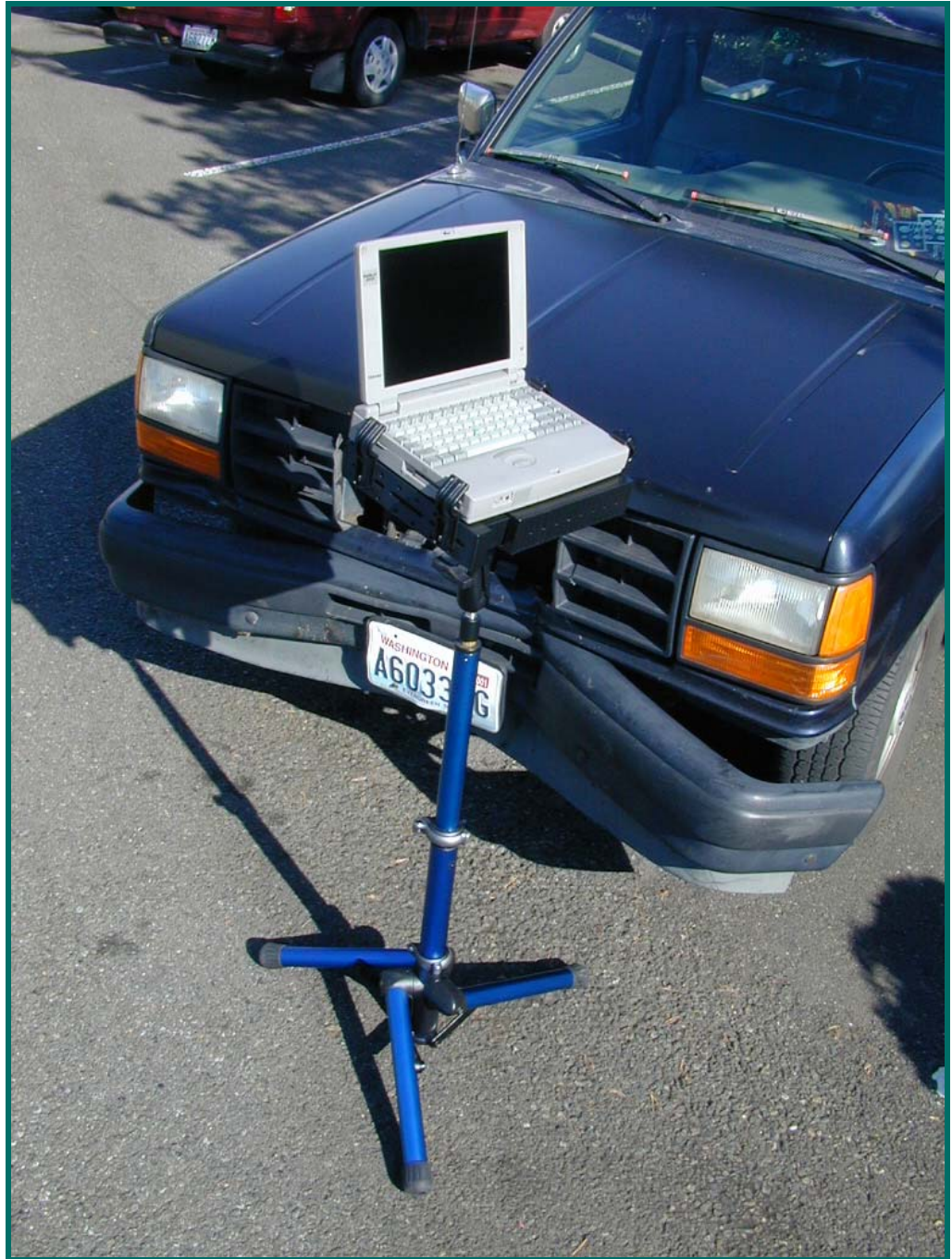
TLS100 Tripod Laptop Stand

The large diameter, wide base, aluminum tripod is designed to withstand heavy "on site" use. It features a spring-loaded platform allowing the user to quickly mount and secure their laptop to the stand. It is an extremely flexible field unit. The base may be extended or retracted allowing the user to either sit or stand.